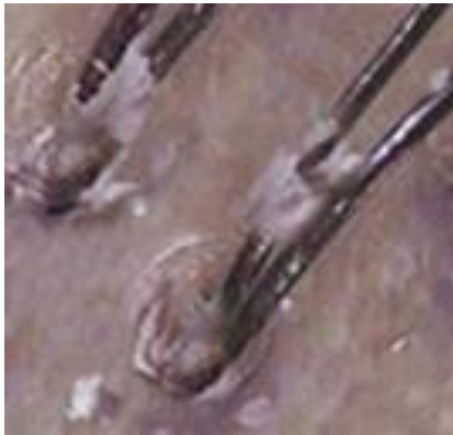
Before XTC™ Scalp Prep

XTC™ Scalp Prep breaks up and dissolves sebum. After Scalp Prep has hydrated the outer layer and dissolved the sebum, Xtreme Hair Boost or Xtreme Growth Therapy will penetrate down to the dermal papilla. Remember, Hair Boost (5% Minoxidil) and XTG only works at the dermal papilla level, not on the scalp, so if it can't penetrate it can't work to re-grow hair.